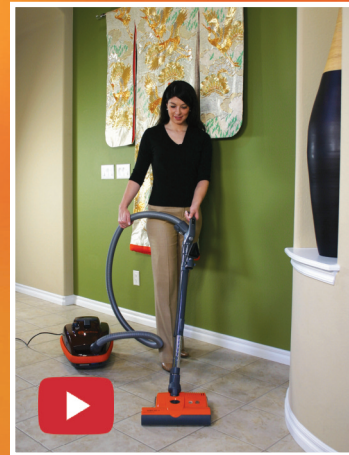
View the YouTube Video of the SEBO ET Power Heads Upright Vacuum Cleaner