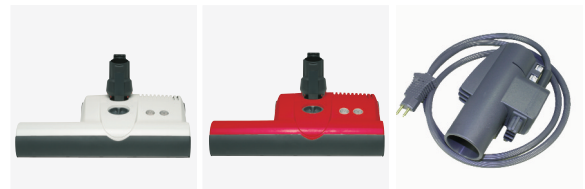
ET-2 White #9259AM

However, its steering mechanism does not rotate left or right. The ET-C features an orange brush obstruction warning light along with automatic shut off. The warning light, located next to the green “on light,” remains illuminated during use when brush agitation is not cleaning optimally, i.e., its brush strip should be replaced because of wear. It has “floating style” brush height adjustment, and the extension side of the head cleans to the edge.