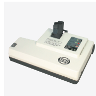
ET-C White #9254AM

The ET-C has a brush roller with a replaceable brush strip. This is part of its heavy-duty sealed brushing mechanism, but the brush cannot be manually switched off. The L-shaped head helps maneuverability around furniture.