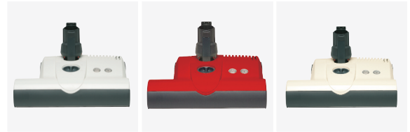
ET-1 White #9258AM

The SEBO ET-1 (12 inches wide, 10 ½-inch cleaning path) and ET-2 (14 ¾ inches wide, 13-inch cleaning path) – This model comes in two widths and has four-level manual brush height adjustment. It aggressively cleans carpets, but the brush roller may be switched off, by pressing the green illuminated on/off button, to clean delicate rugs and hard floors. Its amazing steering ability provides maneuverability around furniture, and the L-shaped head makes edge cleaning easy. It also has easy brush roller removal, a convenient clog removal door, and an orange warning light with automatic shut off for brush roller obstructions. Its warning light also remains illuminated during use when brush height is set too high for optimal cleaning or when the brush should be replaced because of wear. The extension side of the head cleans to the edge.