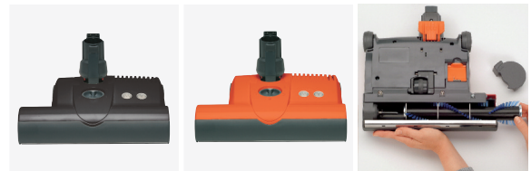
ET-1 Onyx #9951AM