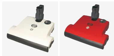
ET-H White #9256AM

The SEBO ET-H Power Head (11 ¾ inches wide, 11 ½-inch cleaning path) – This model’s T-shaped head offers two-sided edge cleaning and variable brush pressure adjustment for optimal cleaning of carpets and hard floors.