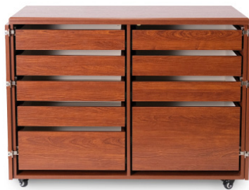
Dingo II Cutting Table

Kangaroo sewing cabinet - check! Now complete your studio with Kangaroo storage and cutting furniture, specially designed to complement your primary workstation. With extra storage and workspace, you can customize your sewing room to be stylish, comfortable, and even more productive!