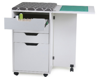
Kiwi Storage Cabinet

Every dream sewing oasis needs its cute, dependable accessories! Add even more convenience with a storage cabinet like Kiwi, featuring a built-in ironing board, cutting mat, thread drawers and a dedicated drawer to store your iron! Your dream sewing space won't be the same without it!