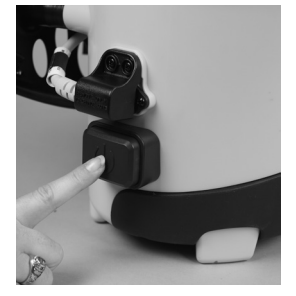
Turn off main power switch and unplug unit from wall outlet.