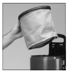
Remove cloth filter bag, clean, dust and replace.