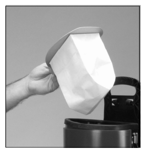
Separate lid from paper bag insert and dispose of paper bag.