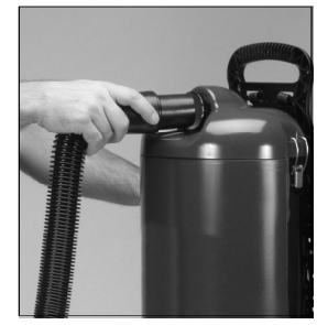
Remove vacuum hose from top of unit.