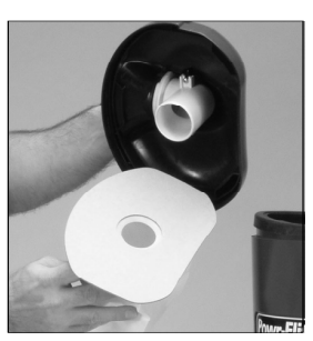
Insert new paper bag making sure to align lid nozzle with bag hole and replace latches.