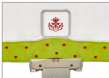
2" x 2" Hoop