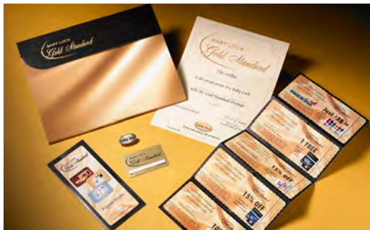
Gold Standard (BNAL-GS)