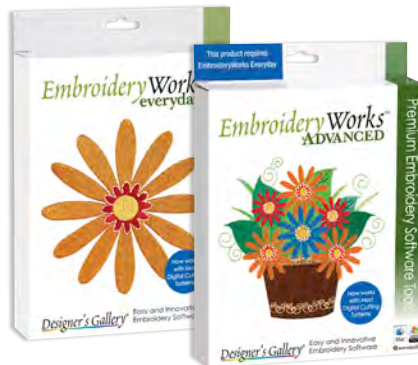
Designer's Gallery EmbroideryWorks and EmbroideryWorks Advanced editing software (EDG-EWEL) (EDG-EWAL)