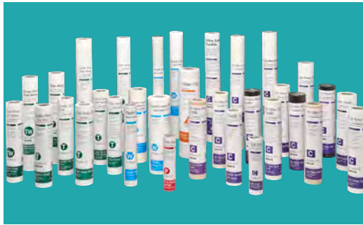
Baby Lock Stabilizer