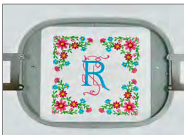
8" x 8" Hoop