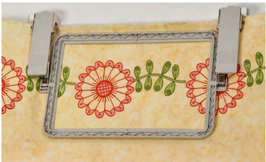
Continuous Border Hoop - 4" x 7" (ALBF)