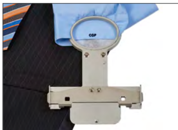
1-1/2" x 1-3/4" Hoop

The Alliance comes with six embroidery hoops, ranging from the nimble 1-1/2" x 1-3/4" hoop all the way up to 8" x 8".