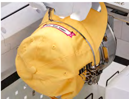
Advanced Cap Frame Set (EPCF3)