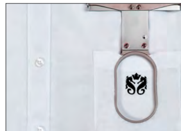
1-5/8" x 2-3/4" Hoop