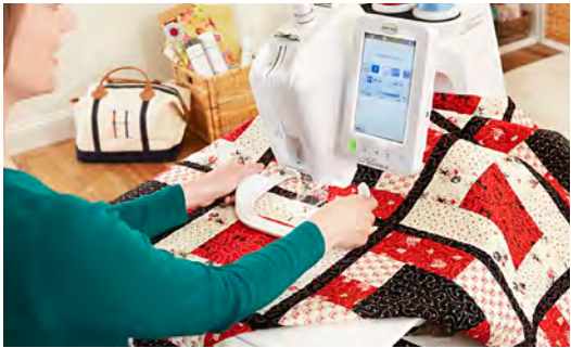
Free Motion Kit (BNAL-FM)