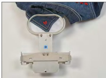
1-15/16" x 2-15/16" Hoop