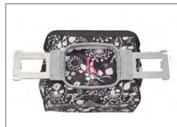
4" x 4" Hoop