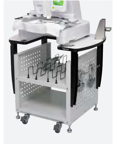
Height Adjustable Stand (ALSTAND)